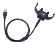
USB snap-on Cable